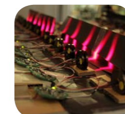
Laser Endurance Test